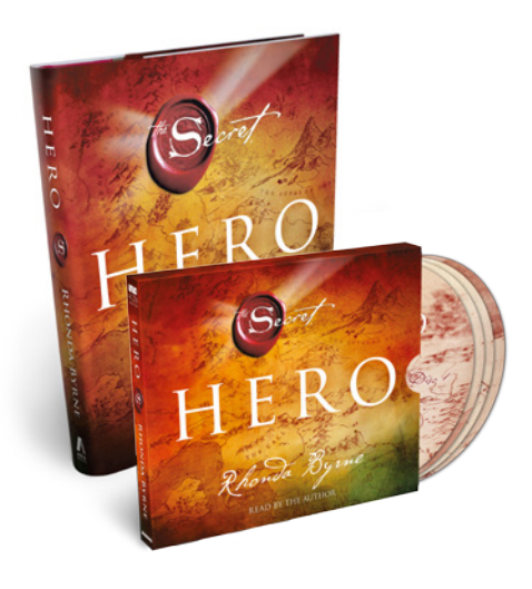
RELEASE DATE November 2013